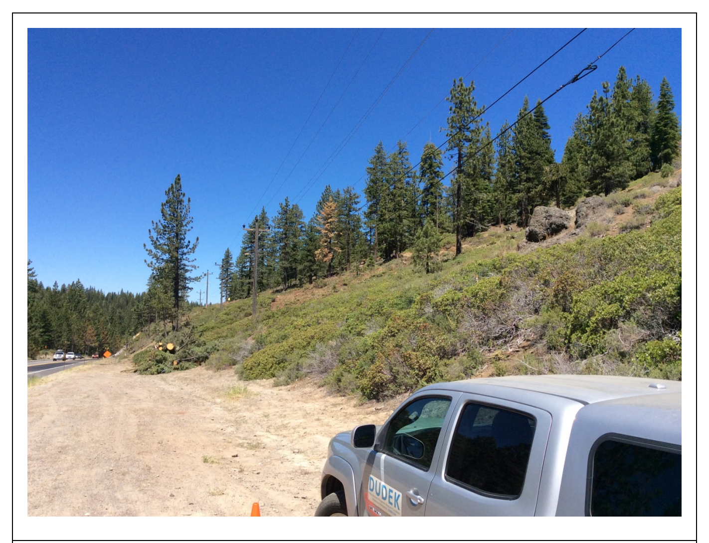
Photo 4: ROW adjacent to Highway 267. Retained trees in nest buffer zone with one newly dead hazard tree identified for removal, near Pole 291129.