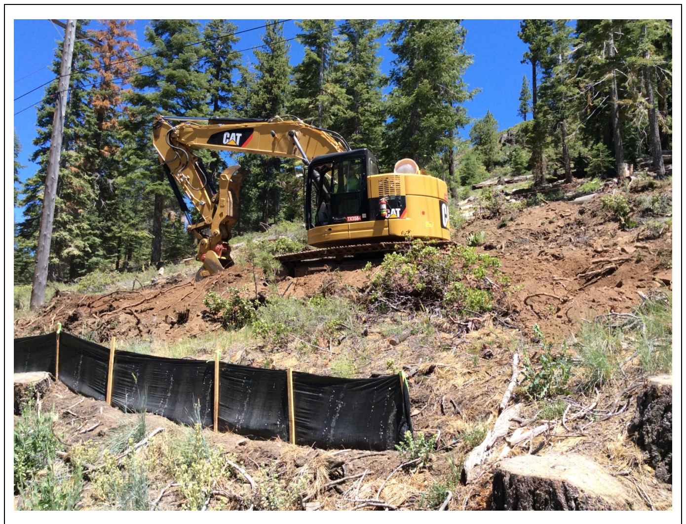
Photo 5: Access road preparation neap Pole 291129. Equipment equipped with spill kit.