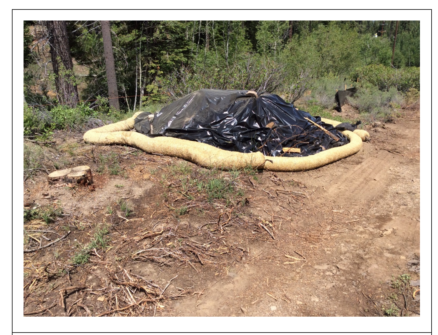
Photo 1 : Excavated soil piles covered with BMPs installed (APM-AQ-6).