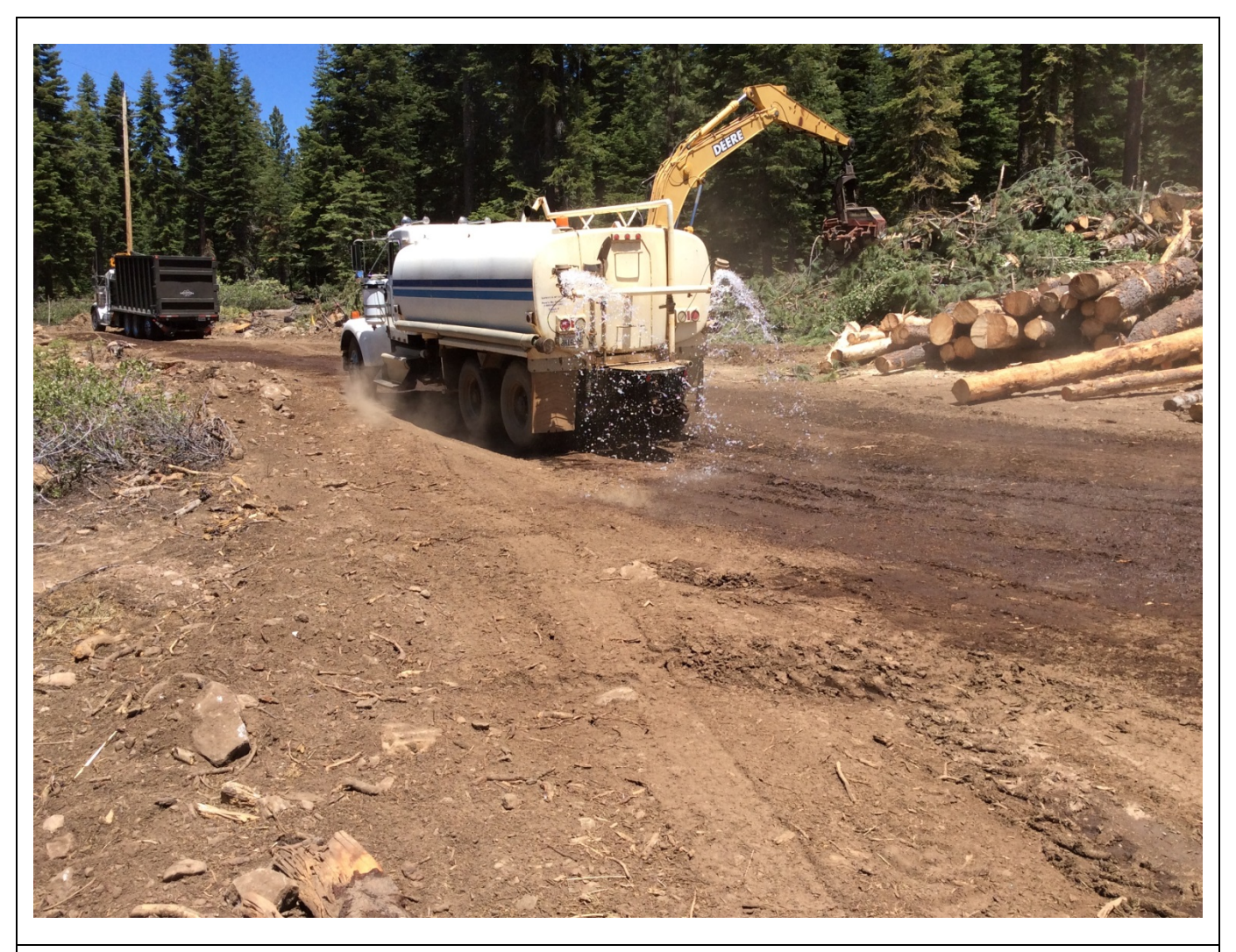
Photo 6: Water truck applying water to control dust at landing near Pole 291169 (APM-AQ-2).