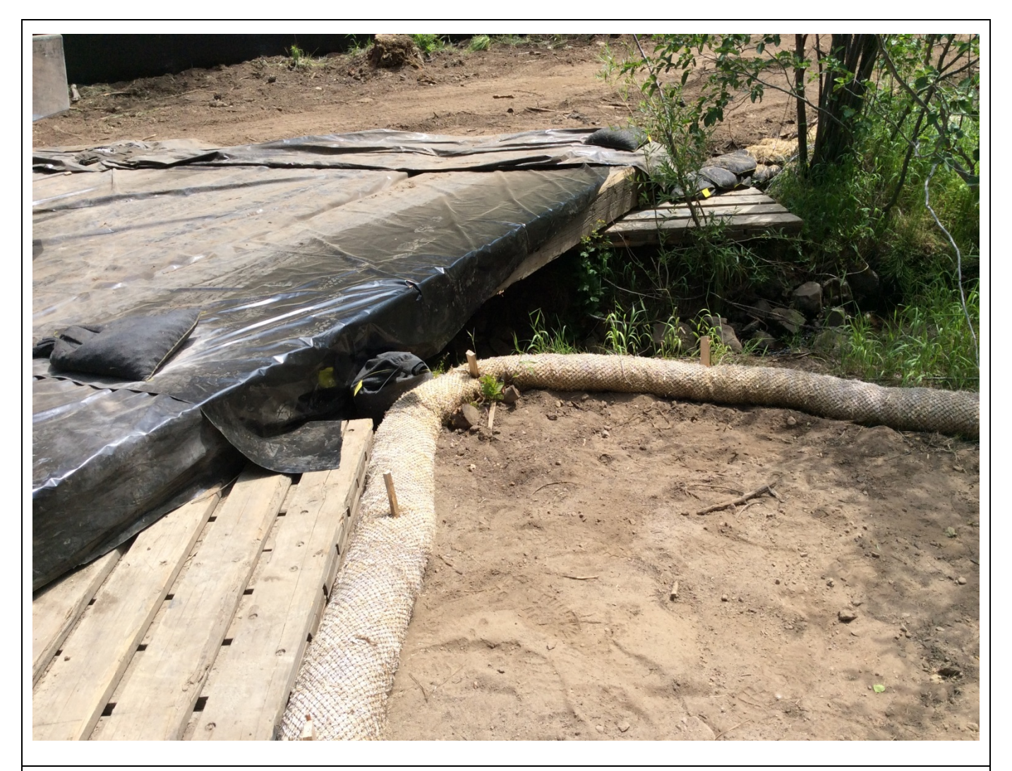
Photo 2 : Temporary timber bridge near Pole 291109 with BMPs installed (APM-SOILS-1).